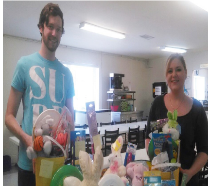
John A Logan provided Easter baskets for the children, which is an annual event.