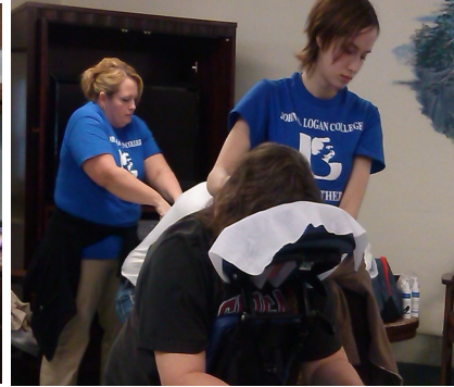
Carterville United Methodist Church organized a "Beautiful Day" for the shelter residents for Valentines Day. They served chicken and dumplings for lunch and John A. Logan Massage Therapist students gave the residents and staff back massages and Mary Kay representatives did hand and feet massage therapy.