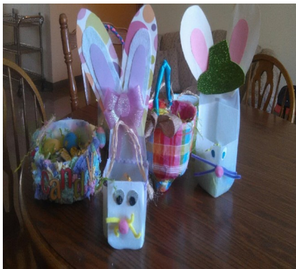
Handmade baskets and wreaths were donated by a community member.