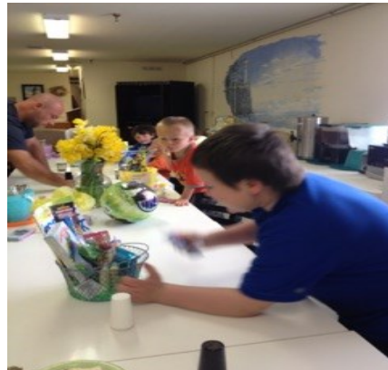
The children enjoyed finding all the goodies in their baskets.