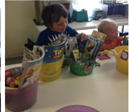
The Garage Church provided lunch and treats for the children on Easter Sunday.