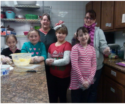
Johnston City Girl Scout Troop 8896 cooked and served an evening meal. A different Troop cooks each month.