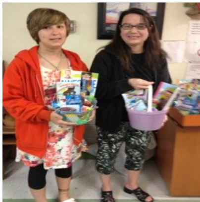
Two Girl Scouts surprised the children with baskets, as well.