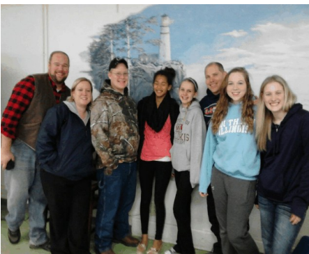
Carterville First Baptist Church youth group had a missions day at the shelter.