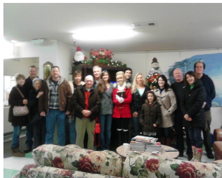
Church without Walls brought gifts for the residents and shared a sermon with them.