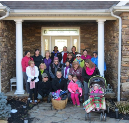
The Blue Thong Club and lake neighbors held a 5 K Run at the Lake of Egypt . Tennis shoes for the residents was the fee to run.