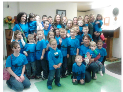
Eagle House Ministries home school students from Vienna provided lunch and a program .