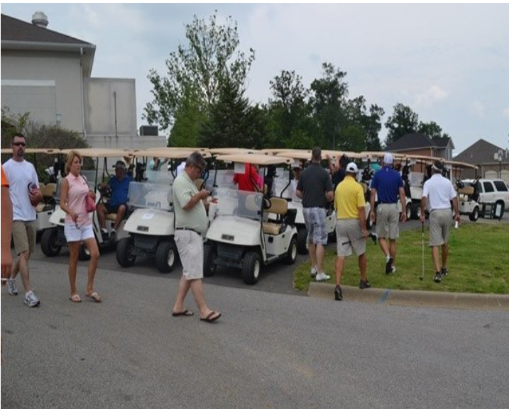
Absher/Arnold Motors golf scramble fundraiser was held June 23 at Kokopelli golf course with proceeds benefiting The Lighthouse. Thanks Absher/Arnold, golfers, sponsors and all who participated to make it a successful event.