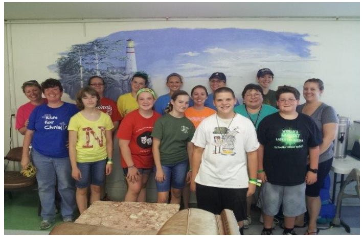
Youth from Little Grassy Methodist Summer Camp volunteered for two days at the shelter doing mission projects. They cooked, served lunch and helped re-organize the children's play area and library.