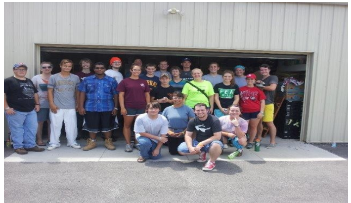
West Frankfort Christian Church camp volunteers helped re-arrange the pole barn. Furniture and household donations are received from the community and residents move on a regular basis so, the storage area is almost always in need of attention.